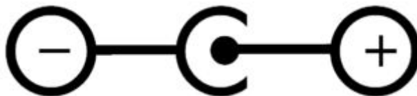
Drawing 1: Power Jack polarity

The WizziGatePro works on a 12V external power supply.